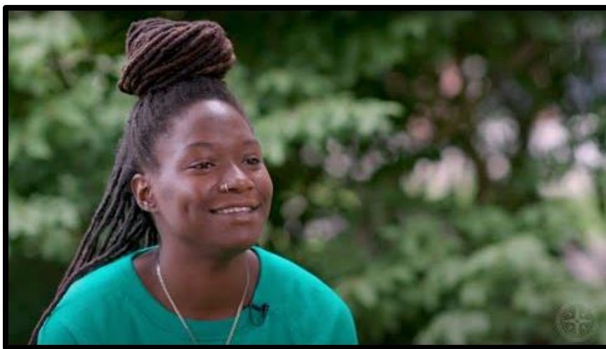
Video: How Thompson Island Outward Bound Changed Me

The Senior Philanthropy Officer will be pivotal in realizing the potential of the Thompson Island Outward Bound's philanthropic community.